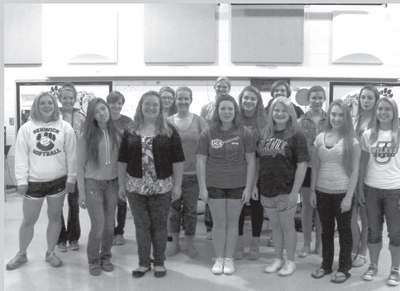
The Modernaires ensemble group gathers for their weekly practice.